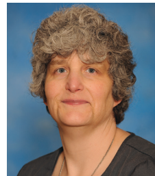
Dawn Hills BS