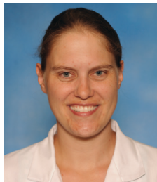
Isabella Pfeiffer DMV, DECVIM-CA (Oncology), DACVR-RO